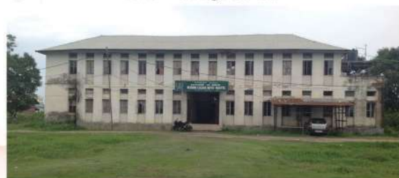
Modern College Old Hostel