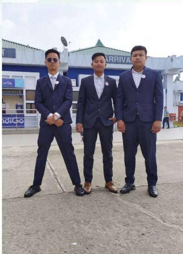
35 th All India Inter University Youth Festival 2020 Amity University, Noida(UP)

The Modern College is proud of having a viable excellent playground which can be exploited to the best advantage by sports persons. Every year, the college organises Inter-house Annual Sports Meet and Cultural & Literary Meet to explore the talents of the students through which Best Sportsman of the year and Students of the year Male & Female are selected.