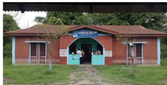
Modern College Students' Union Office