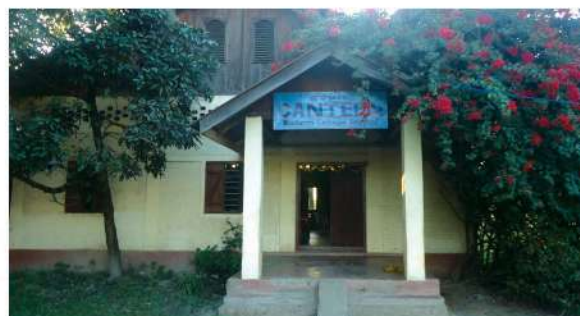
Modern College Canteen