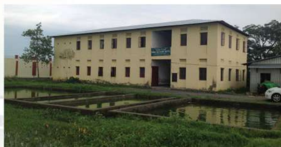
Modern College New Hostel