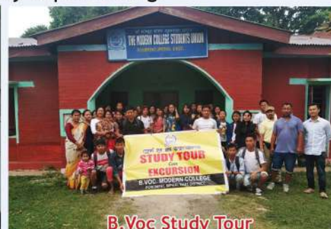
B.Voc Study Tour