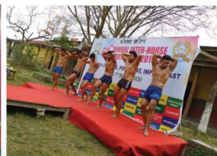
Inter House Sports Meet