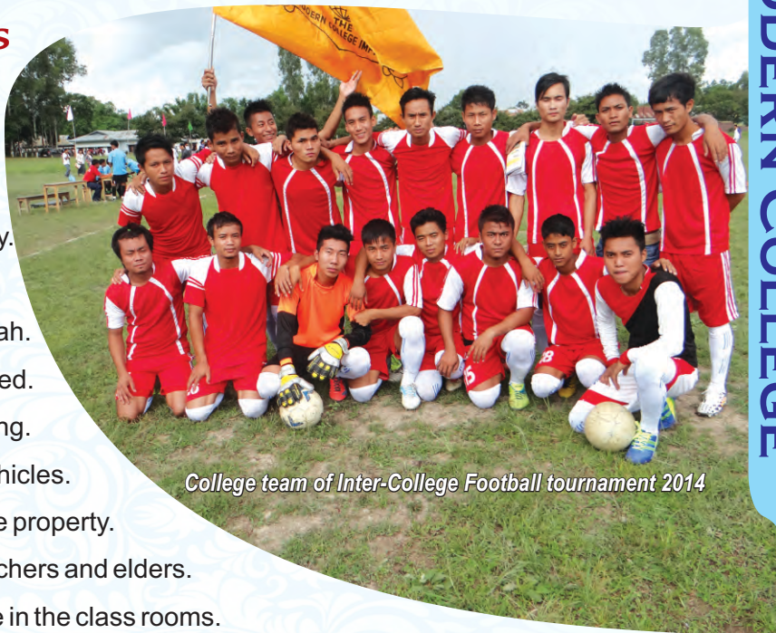
College team of Inter-College Football tournament 2014