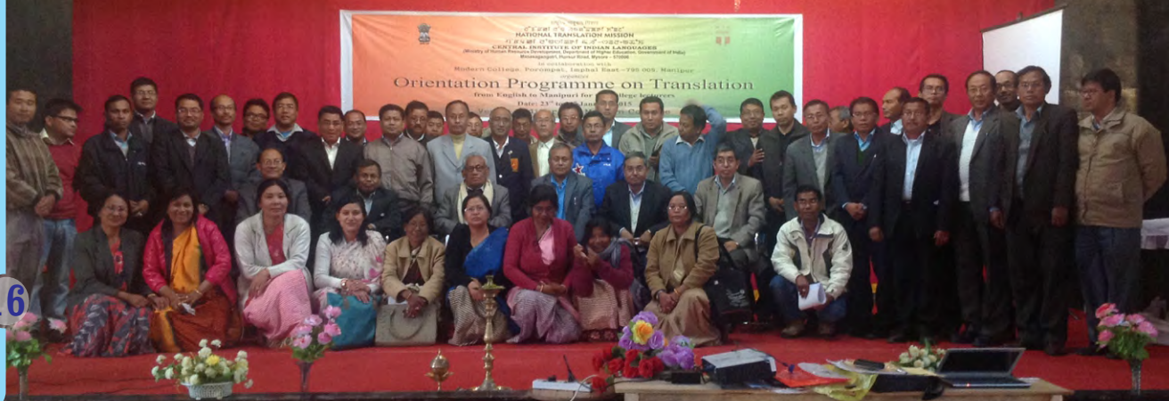
Resource Persons & delegate of orientation programme on Translation jointly organised under National Translation Mission, Mysore, Govt. of India & Modern College