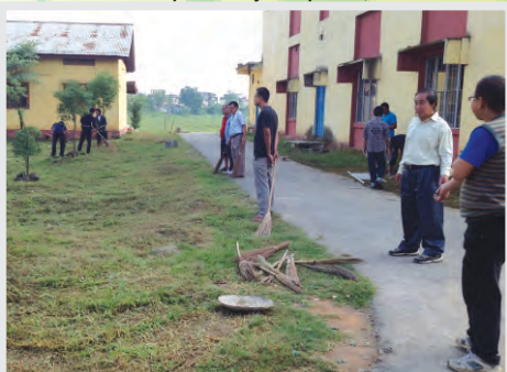
Swachh Bharat Abhiyan Campaign 2014