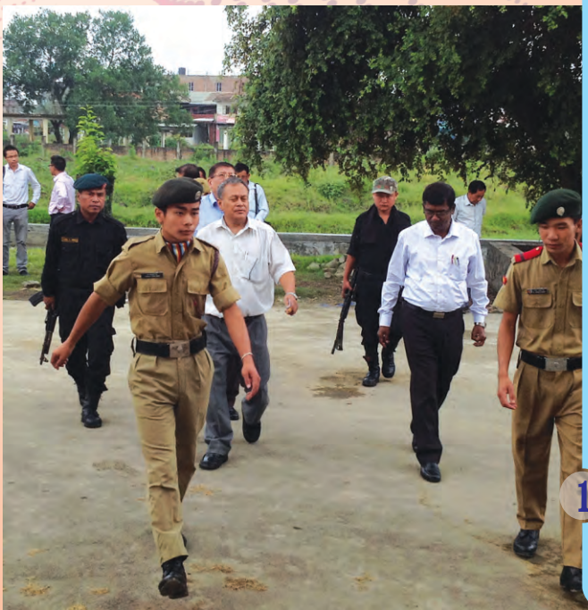
Escorting the VIP for the National Workshop by the College NCC Cadets