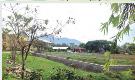
Eco Park Development in progress