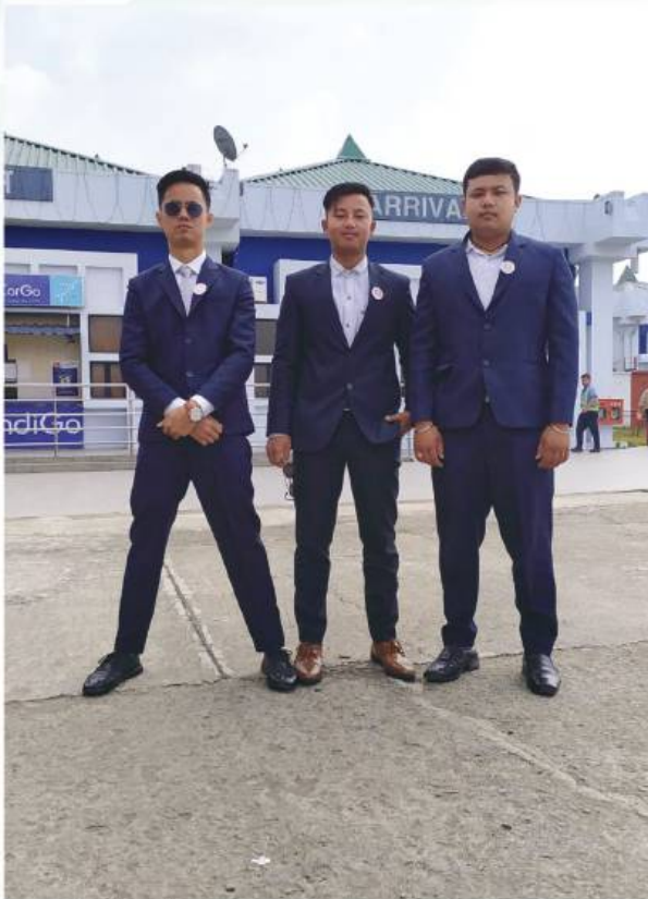
35 th All India Inter University Youth Festival 2020 Amity University, Noida(UP)

The Modern College is proud of having a viable excellent playground which can be exploited to the best advantage by sports persons. Every year, the college organises Inter-house Annual Sports Meet and Cultural & Literary Meet to explore the talents of the students through which Best Sportsperson of the year and Students of the year Male & Female are selected.