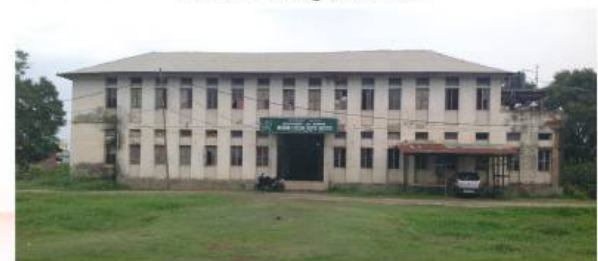
Modern College Old Hostel