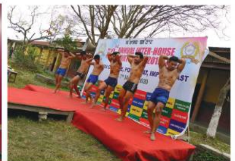
Inter House Sports Meet