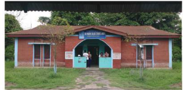
Modern College Students' Union Office