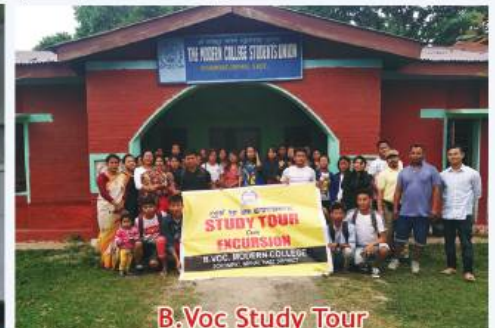
B.Voc Study Tour