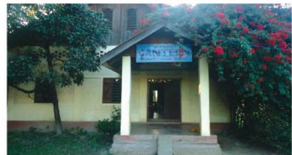
Modern College Canteen