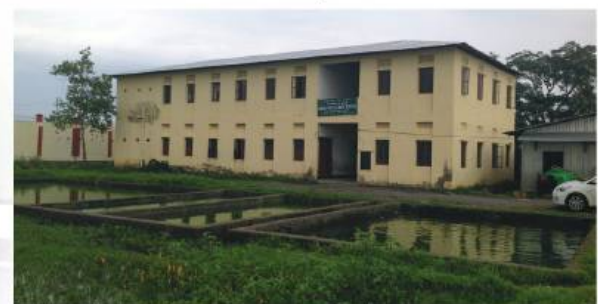
Modern College New Hostel